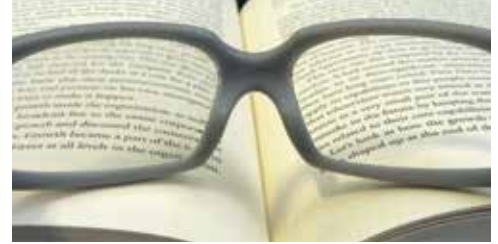
Visijet SL Tough (frame) and Visijet SL Clear (lenses)