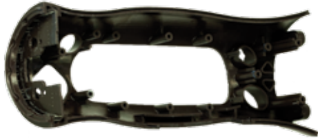
Visijet SL Black

The wide range of Visijet SL engineered materials offers the toughest and the highest quality parts to meet a broad range of commercial and production applications.