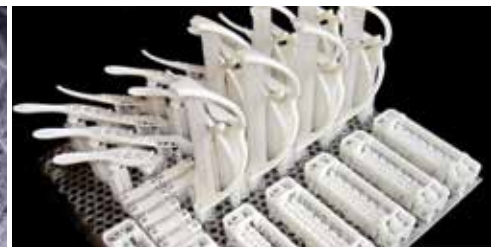
Visijet SL Impact