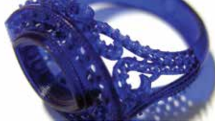
Visijet SL Jewel