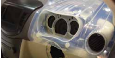
Various Accura materials for form and fit tests of a dashboard

Plastic and composite parts made from Accura SLA materials are the industry's "gold standard" for accuracy, providing excellent resolution, surface finish and dimensional tolerances. Accura SLA materials offer the broadest choice of materials in 3D printing and can easily be optimized for specific prototyping, casting, tooling and direct manufacturing applications.